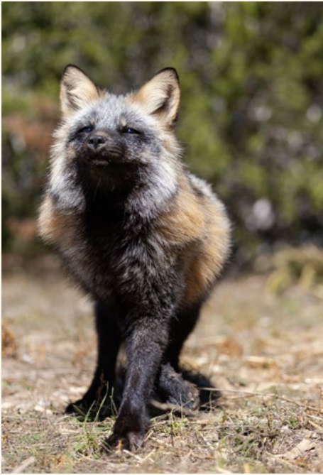
Fox at WRR after rescue from Ohio fur farm.