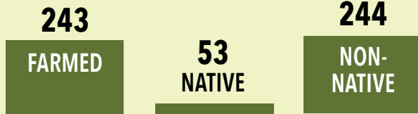
Bar chart not to scale.