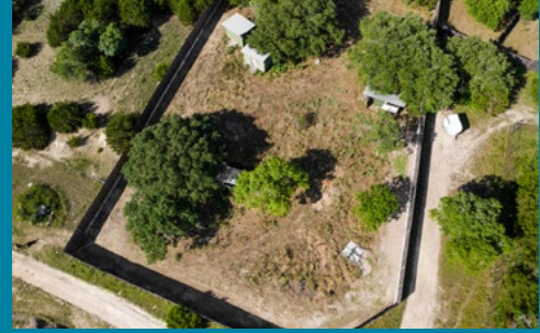
WRR fawn enclosure.